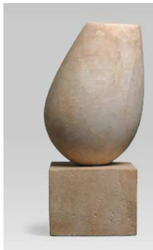
One of many "Woman's Torso" displayed at the Guggenheim Museum.

Times Square. Cold Stone, we understand, is a national ice-cream chain. You pick your ice cream and the ingredients you want thrown in (i.e. Oreo cookies, Skor bar, raspberries, etc.), and they mix it all together right in front of your eyes. If you give a tip, they'll sing for you (at least on this day at this particular store). We visited the ice-cream shop a couple of times while in New York.