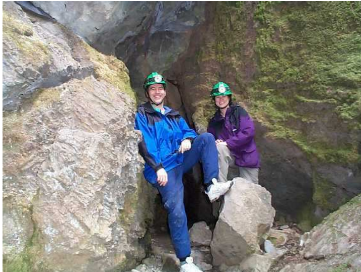
All dressed with our headlamps as we went spelunking at Horne Lake Caves on Vancouver Island.

Also in January, we started a walking/hiking group on the weekend with some people from Susan's work. We went on about 3 or 4 hikes before we were unable to schedule anymore due to busy schedules. Glen and