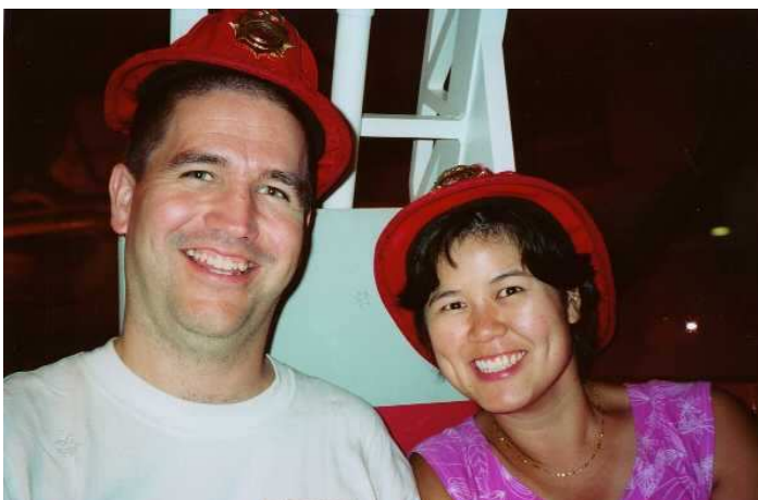
On the Toys 'R Us ferris wheel at Times Square.