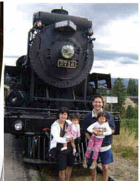
Kettle Valley train in Summerland