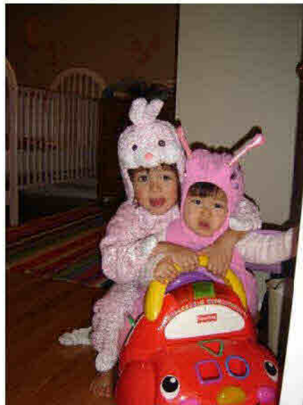
Ready to hit the road and trick or treat